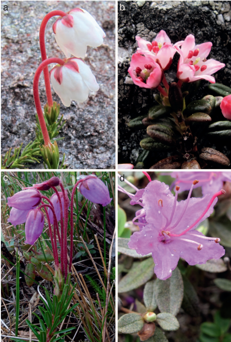
Figure 2. Four state-threatened alpine plants documented on Katahdin in Baxter State Park, Maine. A. Harrimanella hypnoides (L.) Coville; B. Kalmia procumbens (L.) Gift, Kron, & P.F. Stevens ex Galasso, Banfi, & F. Conti; C. Phyllodoce caerulea (L.) Bab.; D. Rhododendron lapponicum (L.) Wahlenb.